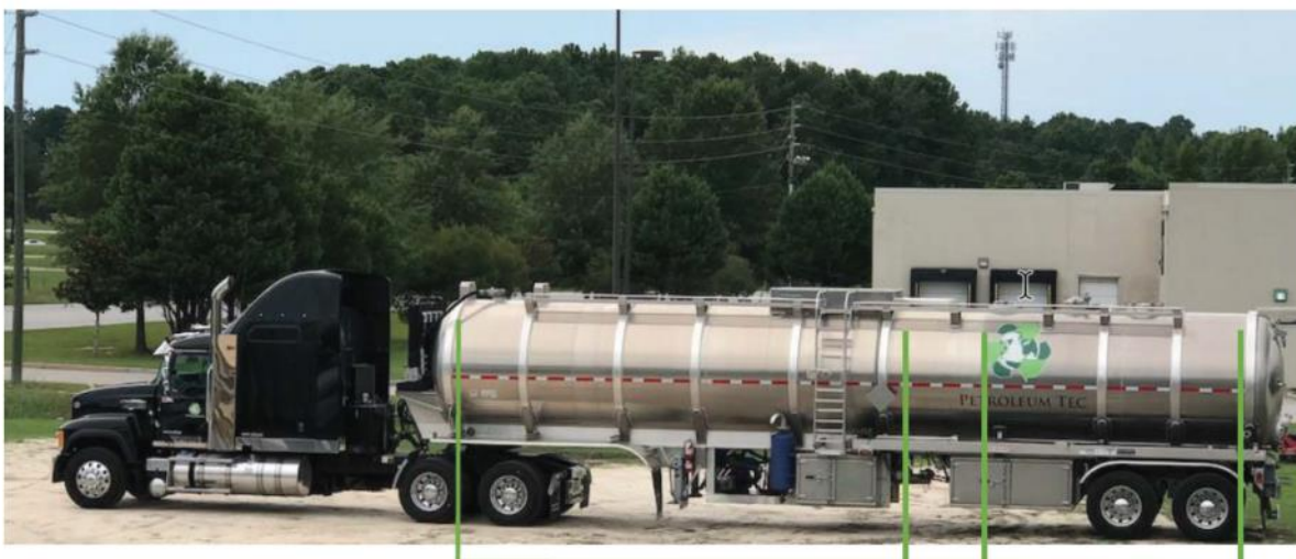
7,000 Fuel Storage Tank