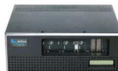
Commander Site Controller