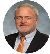
Sen. Danny Verdin Republican—Laurens