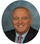
Sen. Mike Gambrell Republican—Honea Path

Hear these industry champions recap the just-completed legislative session and preview what's on the horizon for 2024. Plan to attend and participate on Monday morning.