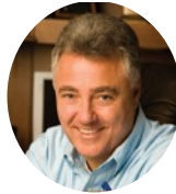
Sen. Larry Grooms Republican—Bonneau