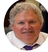
Rep. Jay West Republican—Belton